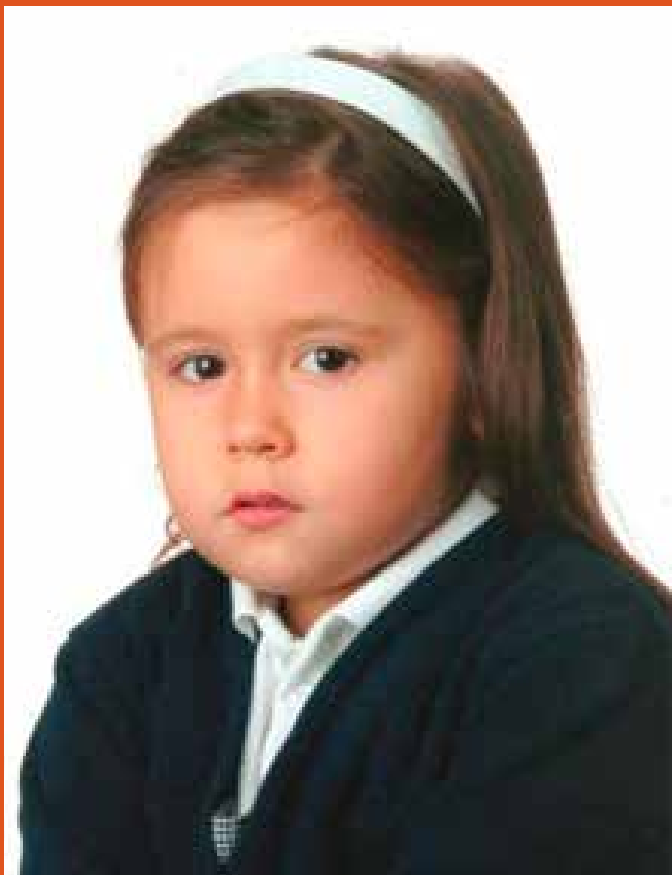
Recuerdo de mi etapa escolar a los 4 años (2008)