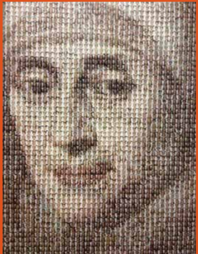
Cuadro Mary Ward hecho con imágenes de los alumnos del colegio

oxygen that allows me to maintain peace amidst the noise. I wish to share with my former teachers and the whole community that today I am a truly happy woman thanks to the Lord and to all those who were instruments of His love in my life. My spiritual journey has matured and grown stronger; I am currently living out my faith with joy through the Franciscan Tertiary studies and the youth group “TAU JOVE” at the Capuchin convent in Arenys