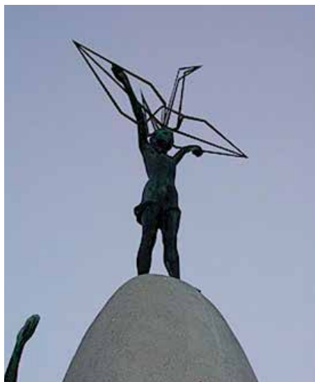
Hiroshima Children's Peace Monument

T he Irlandesas de Loreto School has organized the “A Thousand Cranes for Peace” Project. This project stems from our commitment to promoting peace and harmonious coexistence in our schools and throughout society.