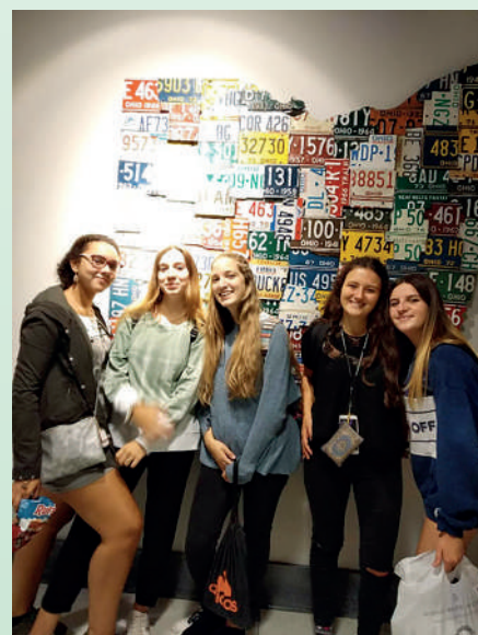
The students from our schools in Seville enjoyed an exchange program with a center in Columbus, in the United States. A very enriching experience of linguistic and cultural immersion for them