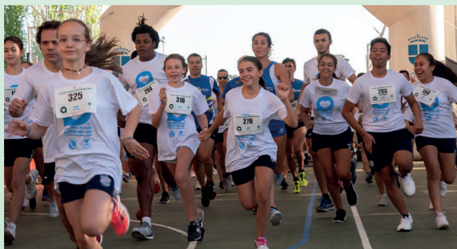
As the past years, the course has begun with the Solidarity Race against Trafficking in Women and Girls organized by the Mary Ward Foundation