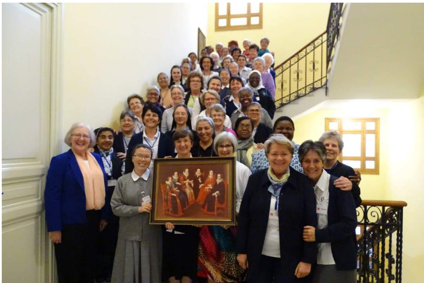
All participants in the meeting of IBVM and CJ celebrated in Via Nomentana, Rome.

All Mary Ward Province leaders and both Generalate teams met together in Rome for a historic gathering on the 27th April, 2017.