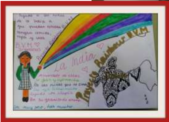
One of the pictures sent by the Spanish students to Kolkata with the message: "Help the Indian girls to study. Rainbow Project".

exchange. From India, they wrote to us: "The meetings with the students and the parents were excellent and fruitful. (...) The effort made by them not only encourages us to work hard but to extend our purview of action